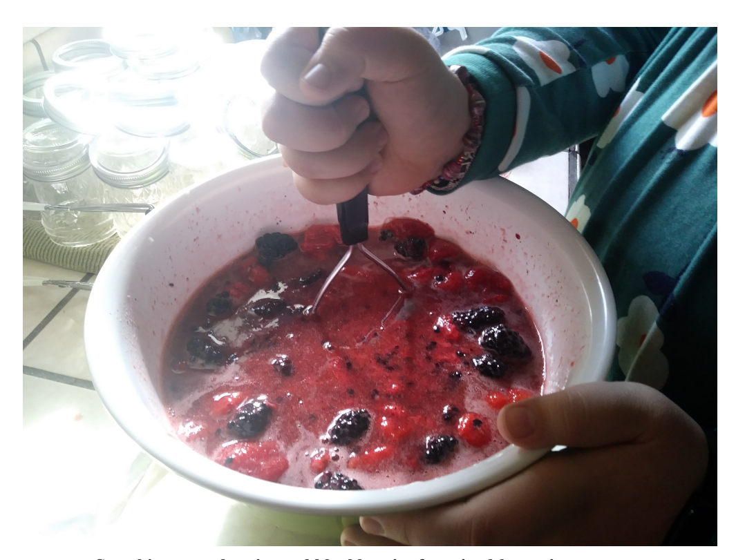
Smashing strawberries and blackberries for mixed-berry jam

This month at the Group Determined Project, which has lately been canning, the project members made strawberry and mixed-berry jam. Here we have one of the members describing his experience: